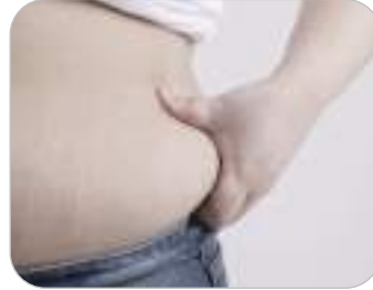
✓ Side belly