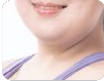
✓ Double chin