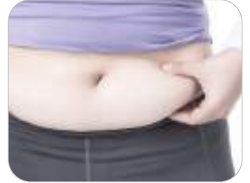
✓ Belly fat